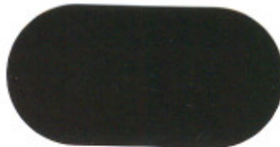
203 COAL BLACK