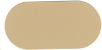
221 SADDLE TAN*