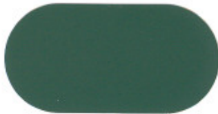
712 IVY GREEN*