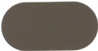
212 BURNISHED SLATE