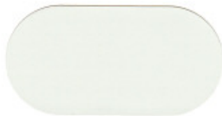
202 POLAR WHITE G-90 Galvanized