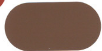
215 KOKO BROWN*