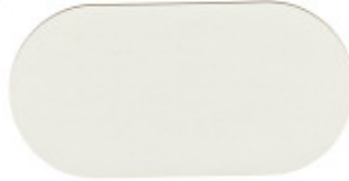
702 REGAL WHITE*