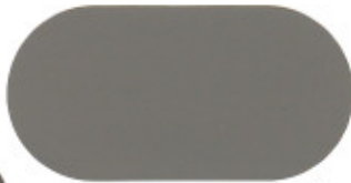
219 CHARCOAL GRAY*