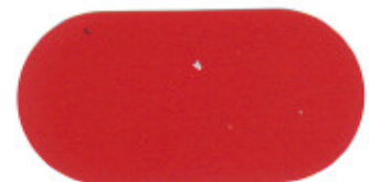
210 CRIMSON RED†