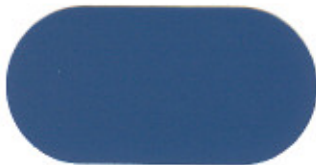
208 GALLERY BLUE